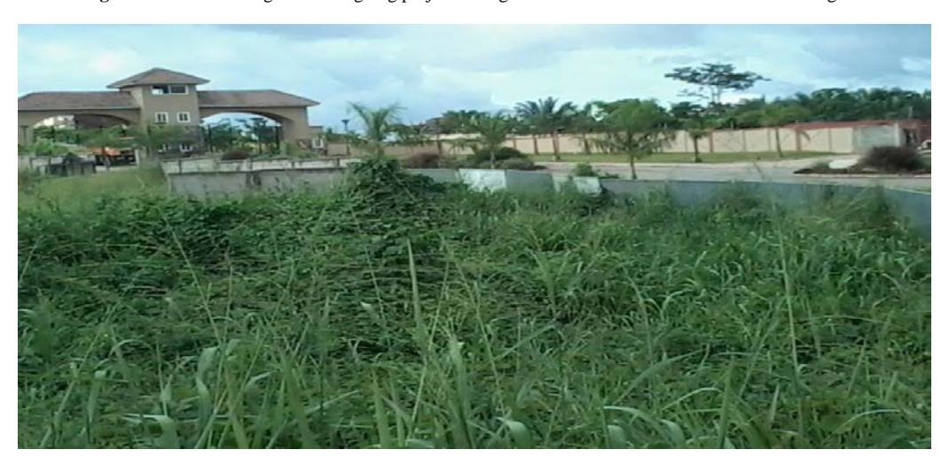
Figure 3. Photo showing the main entrance to the oil village in Western region, Ghana