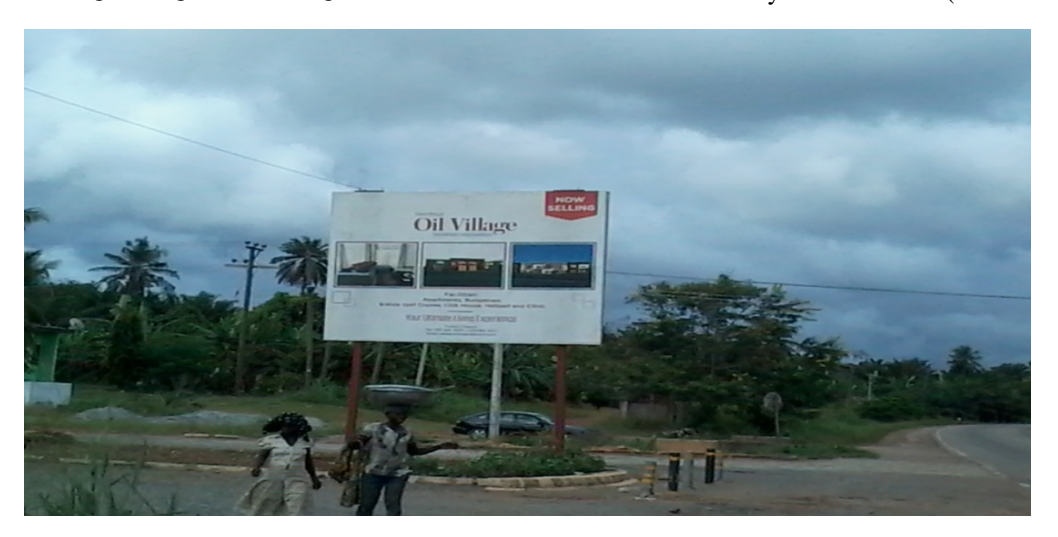
Figure 1. Photo showing real estate's springing up in the Western region