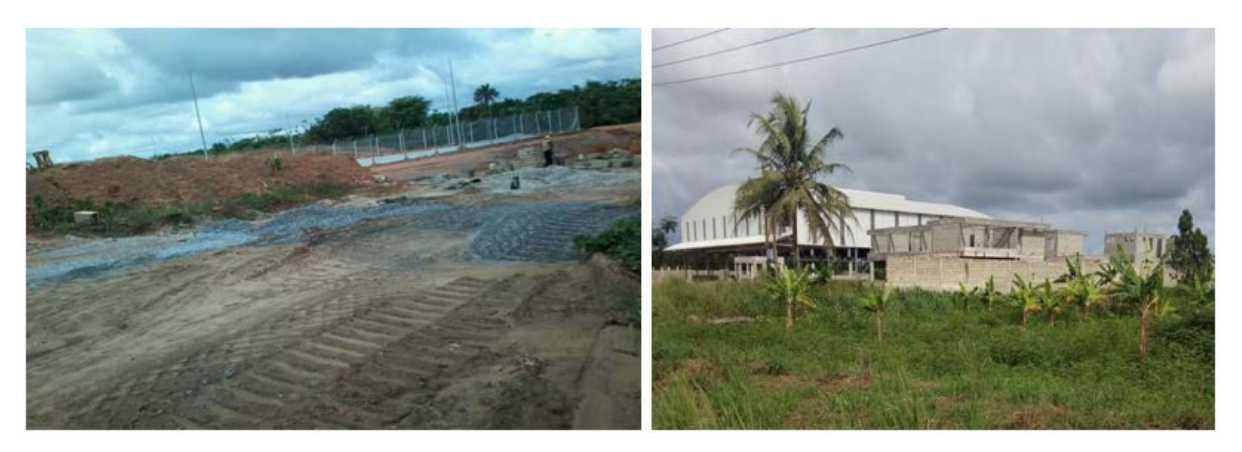
Figure 2. Photo showing similar ongoing projects along the coastal communities of the western region